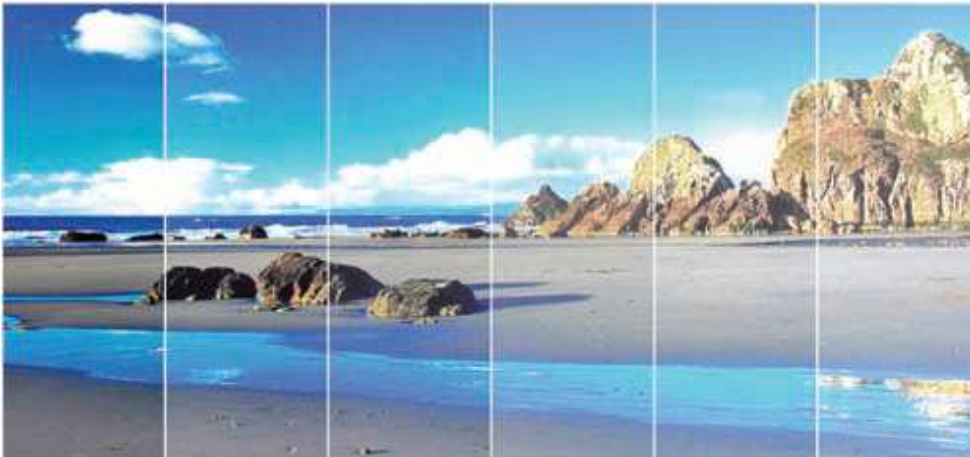
BRAUN SMOOTH ND-VARIO Selected Light Volume Levels